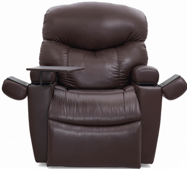
FDA Class II Medical Device