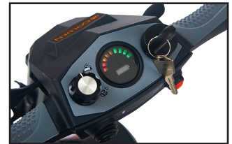
LED battery indicator on the console