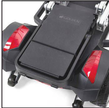
Optional spare battery storage in new rear basket