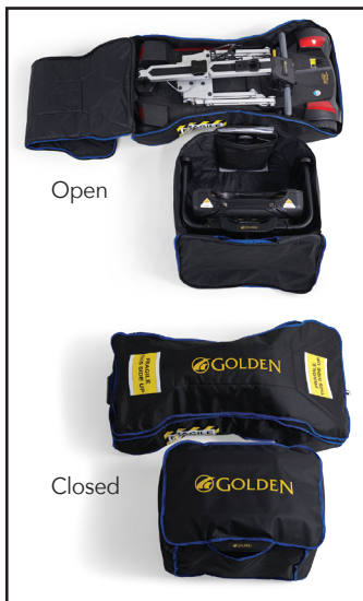
NEW! Optional Travel Bag