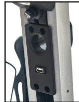
Conveniently located USB port