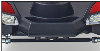
Front carry handle makes travel easy