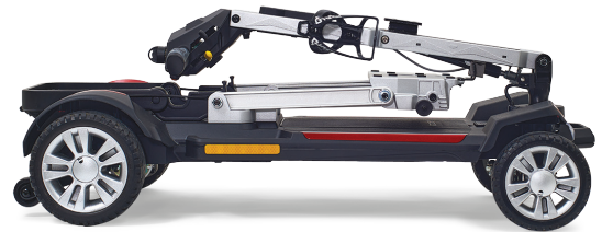
Folds easily for a compact profile of only 12" high (without seat)