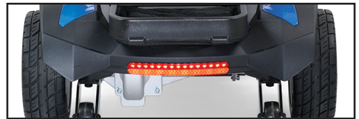
Front & rear lighting package