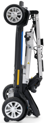
Convenient kickstand for small space storage