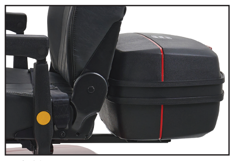
Lockable water-resistant storage compartment comes standard and attaches to the accessory bracket.