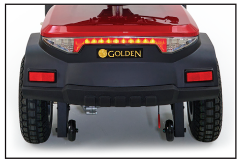
Ultrabright LED rear lights.