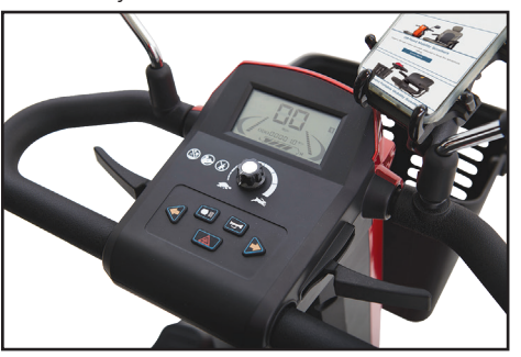
Integrated LCD console display monitors speed, odometer, fault codes & battery life.