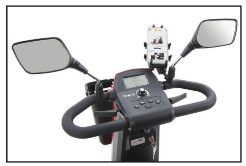
Rear view mirrors, cell phone holder and built-in speaker system with Bluetooth® & USB connectivity.