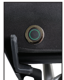
Heated Seat Control