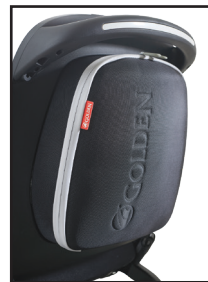
Zippered Water Resistant Backpack