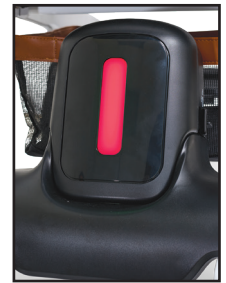
Highly Visible Rear Lighting