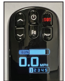
Pre-wired Controller for right or left side placement