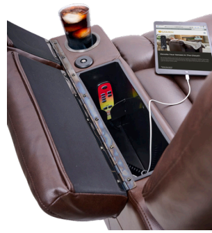
Cup Holder, Power Port, USB Charging Port & Storage Compartment