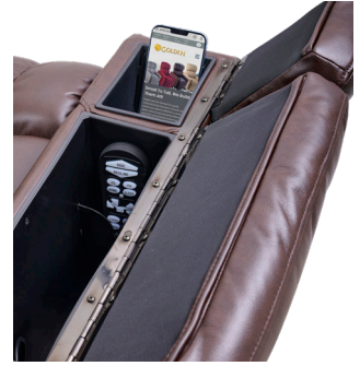
Wireless Smartphone Charger & Storage Compartment