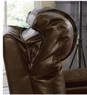
Adjustable Headrest & Lumbar