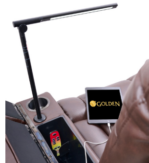
Removable LED Reading Light & Tray Table